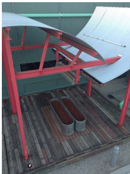
Above: Overhead view of Watershed

The artwork is a sculptural assemblage installed adjacent to the HHW, and is composed of integrated elements that relate to a fundamental of human existence: gathering and storing energy. The location of the artwork next to a facility that manages waste that requires special handling was inspirational to the artist in his consideration of human relations to earth, water, and food. With emphasis on the aesthetic qualities of food – through the incorporation of beautiful historic olive trees, and water – with the creation of the water feature based on an historic “flip-flop flume”, these elements are employed as metaphors for basic needs. These elements include historical and current references to technologies and methodologies. In this context, they become suggestive of the fundamental aspects of human existence weighed against the continuing stream of materials that moves through our lives at various levels of expense and consequence, i.e., what we need versus what we want and no longer want and must dispose of.